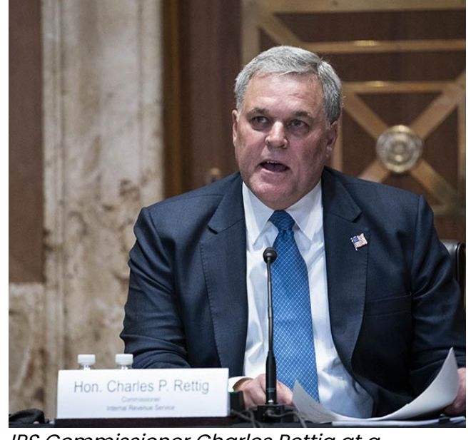
IRS Commissioner Charles Rettig at a Financial Services and General Government Subcommittee hearing in May 2021.

ICIJ spoke with more than a dozen current and former federal tax officials, as well as experts in the field, who painted a picture of an agency at a pivotal moment as it tries to modernize while coming under frequent political attacks. Equalling the might of the billionaire entourage is a goal that many agree is years away. Now may be its only chance to lay the groundwork.